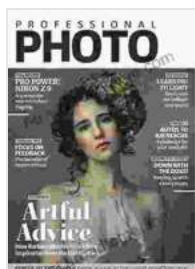
image evaluation, portfolio building, and project-based learning empowers you to take ownership of your artistic journey, refine your technique, and create a portfolio that commands attention. Free Download your copy today and embark on a transformative adventure that will elevate your photography to new heights!